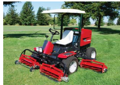
Baroness Reel Rough Mower LM285