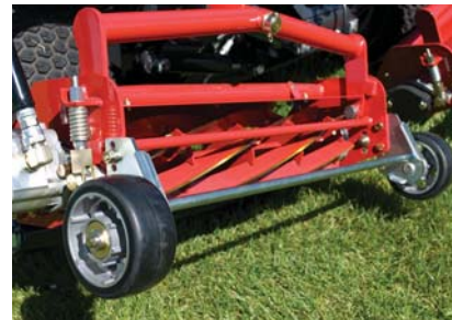
Caster wheels for mowing long or over seeded grass.