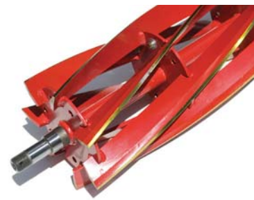
Choice of 5, 7 or 9 blade reels.