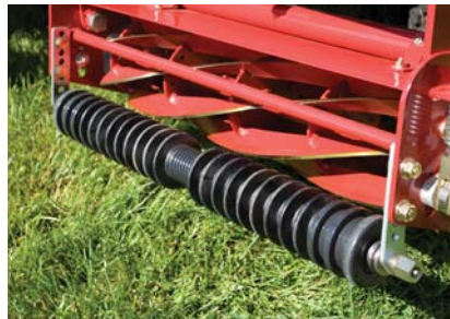
Front roller for regular use.