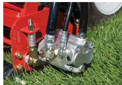
Option of 22cc motor for cutting long grass.